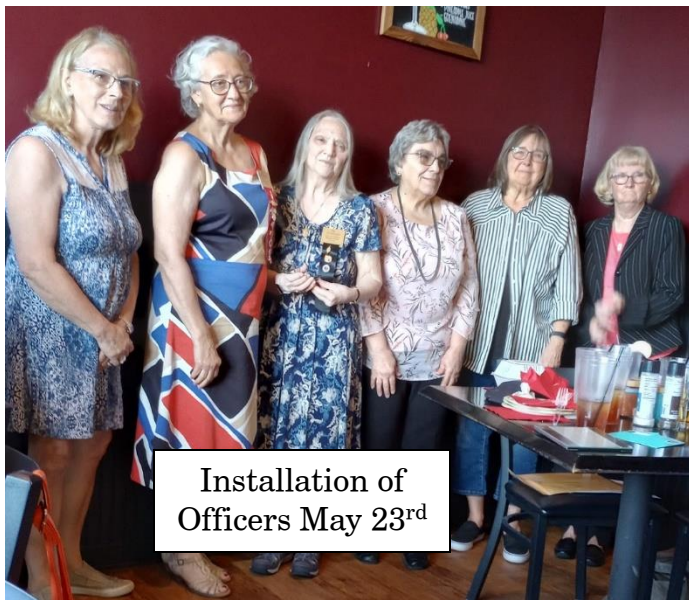
Installation of Officers May 23 rd