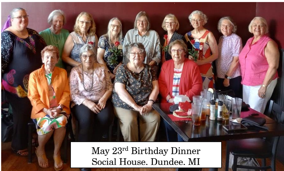
May 23 rd Birthday Dinner Social House. Dundee. MI