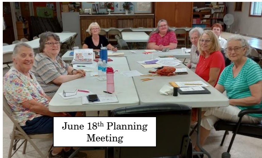
June 18 th Planning Meeting