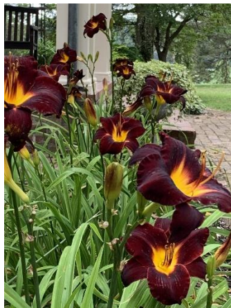
Lilies