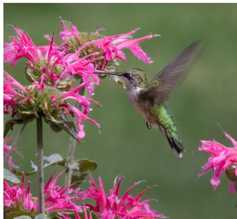
Hummingbird and Monarda