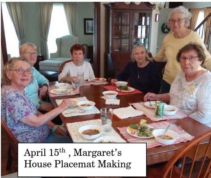
April 15 th , Margaret's House Placemat Making