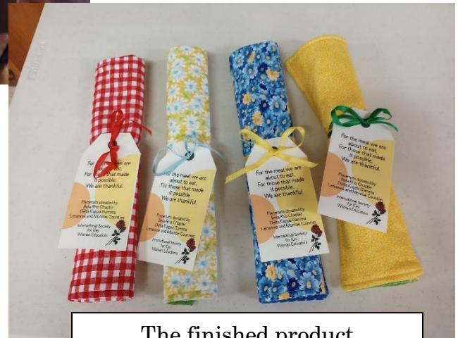
The finished product Susan H delivered them.