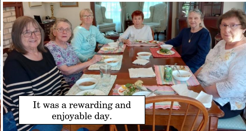
It was a rewarding and enjoyable day.