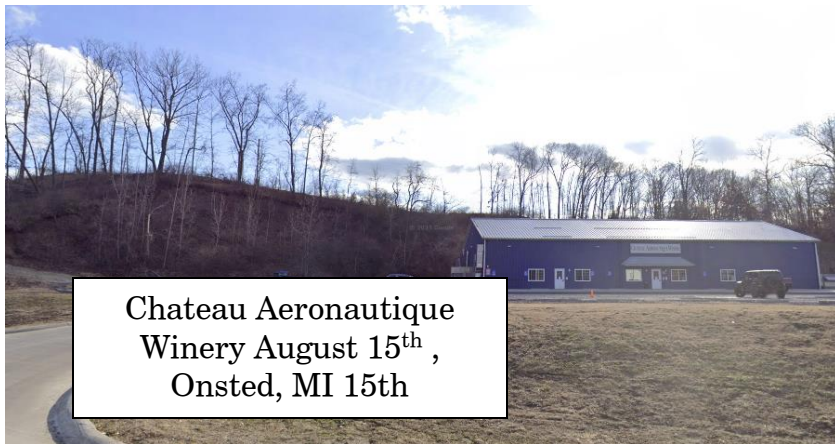
Chateau Aeronautique Winery August 15 th , Onsted, MI 15th